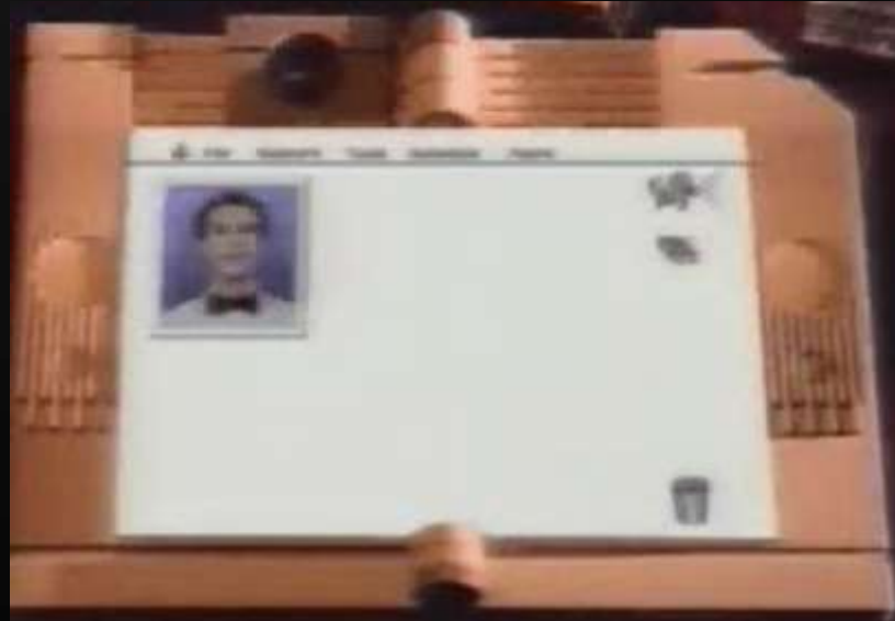
Apple Knowledge Navigator concept video (1986)

... an internet-enabled, personal “pad” that you can dialog with, learns about your preferences, and can do things for you?